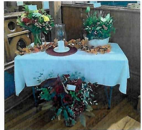
Flowers adorned the sanctuary